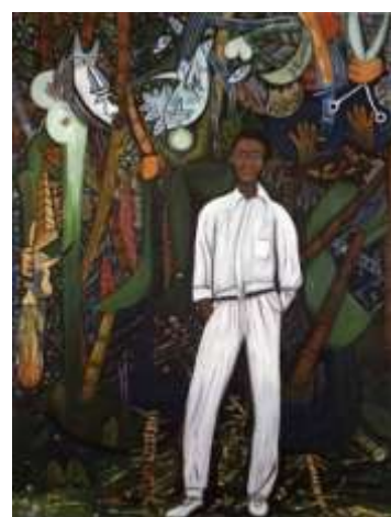
Not Currently on View