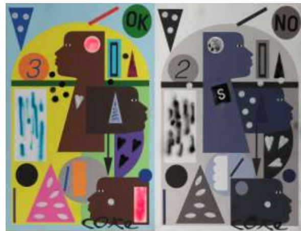
Not Currently on View