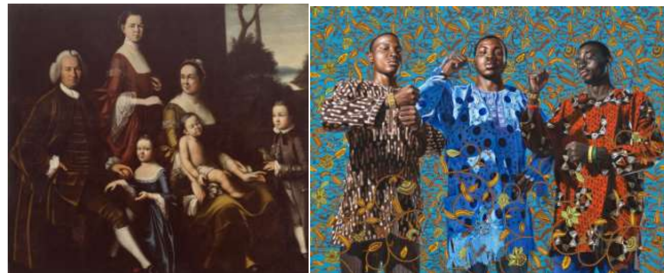
Not Currently on View

Paul Lansky: Harmonic Gallery , for chamber ensemble, was not created in conjunction with a specific work of art but is “a musical analog of a museum exhibition in which paintings, sometimes created hundreds of years apart, are shown in close proximity.”