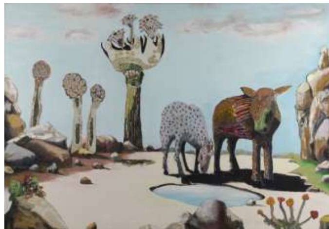
Not Currently on View